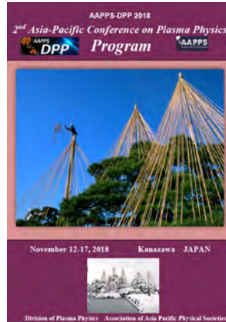
DPP2018 Kanazawa 700 participants