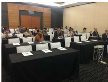
Basic + Applied plasma session