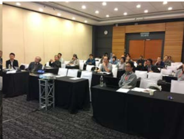
Astro plasma session