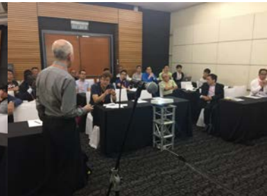
Magnetic Fusion plasma session