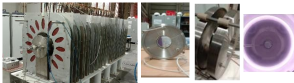
Fig.1 – experimental device and plasma source

At the Institute for Plasma Research, India, a new experimental setup for studying Sheath Phenomena Involving Negative ions has been setup with focus on understanding : (1) the role of electron kinetics in negative ion production and transport across magnetic field; (2) Investigation of sheaths in the presence of negative ions; (3) Generating basic experimental data for validation of theoretical model on electronegative discharge; (4) Characterization and benchmarking of novel diagnostics; (5) To study basic phenomena in negative ion plasma due to wake introduced by external perturbation and (6) Numerical Modeling. The present topic aims to highlight some recent theoretical and experimental results on negative ion source, diagnostic and sheaths involving negative ions.