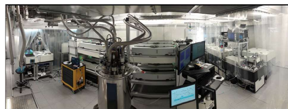
Fig. 2 : Picture of the HIBEF laser

We will also present the design and the results obtained on the HIBEF system. This 500TW / 5Hz system has been designed to ensure reliable performances that are required in the frame of accelerator programs. In order to obtain stable parameters on the target (beam size, pointing, energy) we have developed a Twin amplifier design using cryocooled crystals. A special care has been taken in the design of the cooling to minimize the mechanical constraint (thus keeping the wavefront deformation as low as possible) and avoid the transverse lasing. This system has been successfully commissioned in 2019 and we will present some of the results (Fig.2).